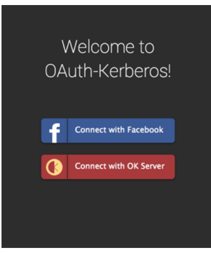
(a) The login screen