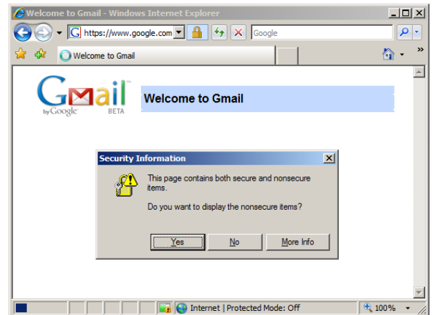
Figure 2: Users have been trained to click through mixed content warnings at sites such as Gmail.

As with certificate warnings, many users do not understand mixed content warnings, and some browsers do not even give users the option of remaining secure. Users have been trained to ignore these warnings because many HTTPS pages, such as the Gmail login