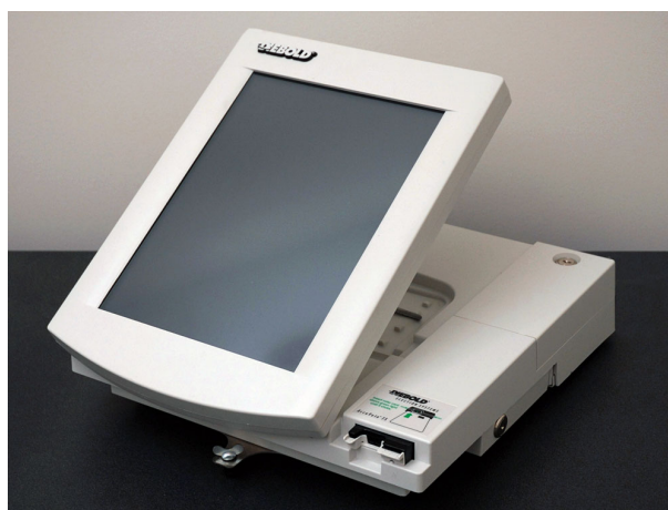
Figure 1: The Diebold AccuVote-TS voting machine

This paper reports on our study of an AccuVote-TS, which we obtained from a private party. We analyzed the machine's hardware and software, performed experiments on it, and considered whether real election practices would leave it suitably secure. We found that the machine is vulnerable to a number of extremely serious attacks that undermine the accuracy and credibility of the vote counts it produces.